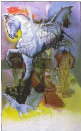
Wolfgang Petrick. Sprung , oil on canvas

Time: 6:00p.m. • Tickets: $6 donation per person at door