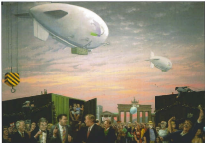
Matthias Koepel. Start of the Firm Noah 2000 , oil on canvas

Time: 7:00-11:00p.m. (following UTSA Reception) • FREE and open to the public